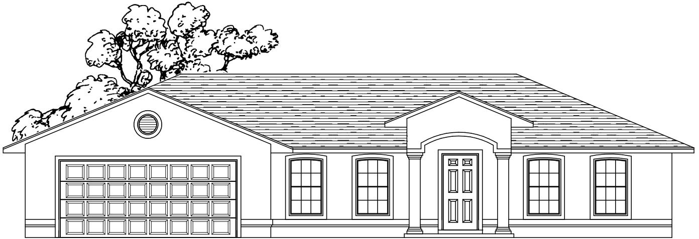
THE MONTEGO A