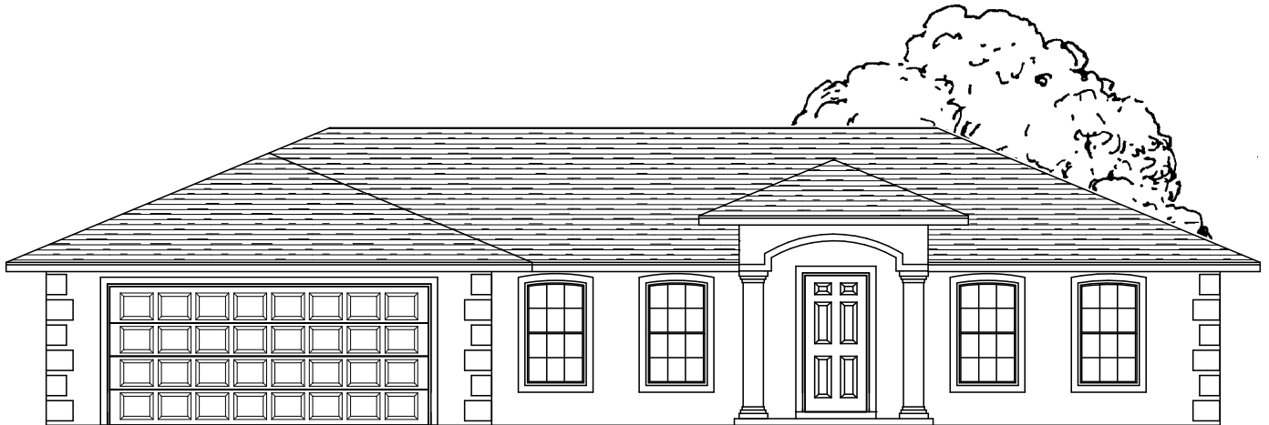
THE MONTEGO B